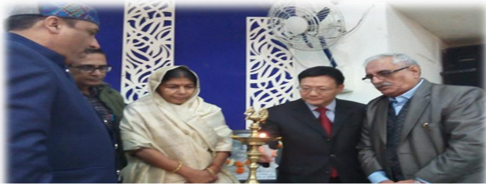
ASA India organized National Convention on Recognition of Acupuncture in India & 5th National Meet Delhi Dec. 16 - 2017